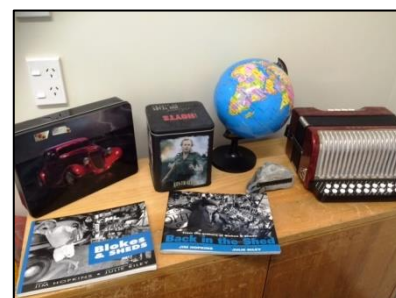
A special corner for our gentlemen in the Memory Room

Please remember that there is an open invitation for you to join your loved one for a meal.