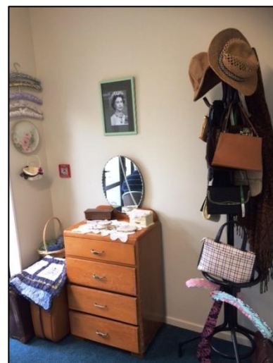
Our lovely Memory Room is a refuge from a bygone age, full of treasures to explore

Sing-alongs with residents in the dementia home and having one of them play the piano. Seeing them smile and enjoy the engagement and sense of purpose in singing familiar songs together is truly wonderful.