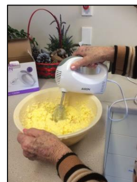
The simple pleasure of baking a cake

Join a dementia awareness group, or contact your local Alzheimer's organisation.