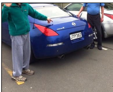
Members of our Men's Club enjoy a visit to a car sales yard

The tradition of giving a gift at Christmas time can be difficult when your family member or friend has dementia. The Alzheimer's Association has shared the following excellent suggestions for gifts suitable for every level of care. Early stage games and activities should reflect the person's interests and challenge them to exercise their brain as well as their body. Later stage gifts should concentrate on providing comfort while stimulating the senses.