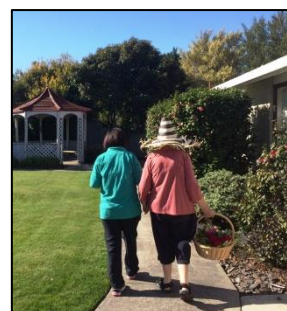
Enjoying a stroll in the garden together

Visit our website at www.dementiacarenz.co.nz to link to our Facebook page.