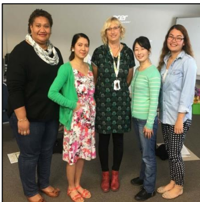
Proud staff members upon their completion of the “Walking in Another’s Shoes” master classes

We promise we will give your loved one the very best of care. We promise we will appreciate, respect and love your special person. We will be honest, open and trustworthy. This is the work we have chosen to do.