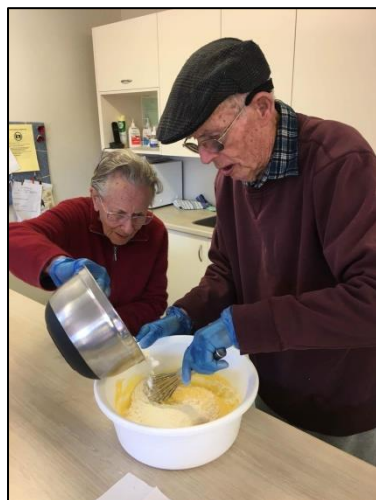
There is much pleasure in working together over a shared homely task such as baking

Rest assured that you will be very welcome to be with your loved one for the days and hours leading up to this important time, and we will support you in making this journey one you feel at peace with.