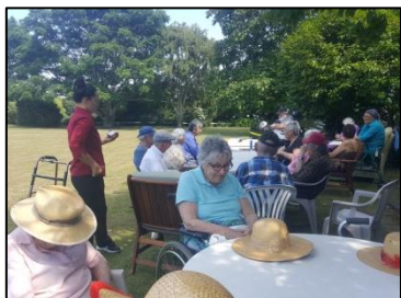
Residents enjoy a quiz with morning tea out in the garden

I have been enjoying coming to Leighton regularly and talking recently with new staff about our Vision and Values. This is an important opportunity to make a personal connection with each person who has chosen to work for us, and gain an understanding of the very special qualities which have drawn them to the work we do. Home and family are values which consistently shine through, and which we all share. Our Vision and Values links closely with our flagship 'Best Friends Approach to Care' course. This encourages all those who work for us to draw on their personal experiences of close and loving relationships in their approach to care. We are in the process of renewing our Vision and Values at present to ensure