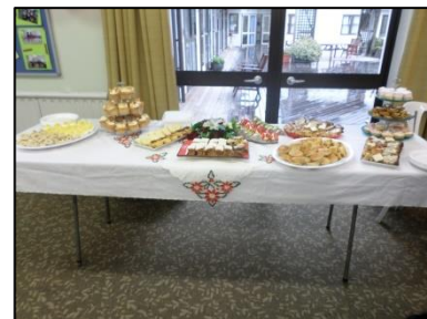
Leighton House is known for our delicious home-cooked food

The friendship of our residents is a reciprocal gift which brings joy, understanding and acceptance to our relationships with one another here in our home.