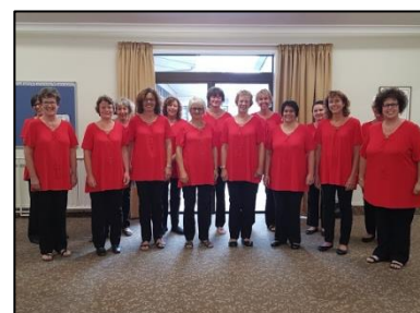
"Savvy Ladies" came to entertain us with Christmas carols in December

Please discuss this with the registered nurse if this is the case.