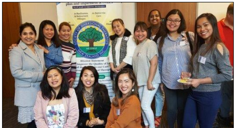
Dementia Care NZ had a great contingent at the Annual Diversional Therapy Conference in Christchurch