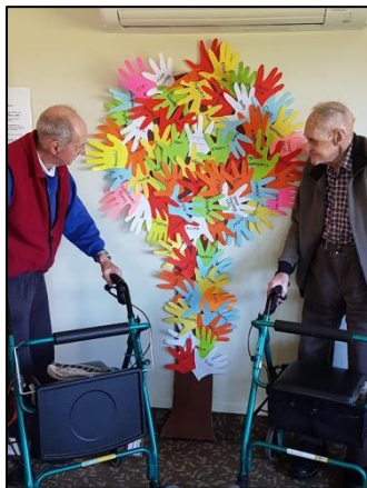
We created an aspen tree, where residents wrote down things they love about Leighton

Please remember that all new items need to be clearly marked with the owner's name before they arrive. This is especially important at Christmas time, when many lovingly chosen new items are given as gifts by family members. We discourage expensive woollen items, which are easily damaged in the wash. Please select easy care clothing wherever possible.