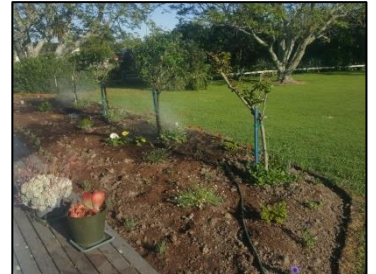
We have enjoyed discussing what should go into the new garden created along the walkway

I wish each and every one of you a very happy Christmas.