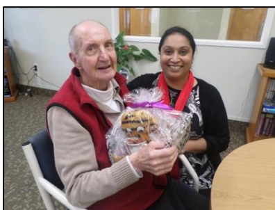
We are so grateful for the Wahine Active Bub's Mum's' club, who brought in wonderful and thoughtful gift packs for a number of our residents