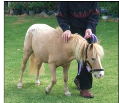
We were joined by a special guest for Melbourne Cup Day

that closely mirrors a household living experience, with access to familiar homely pursuits such as showering, choosing what to wear, applying makeup and selecting jewellery, shaving, setting the table, folding linen, peeling vegetables, flower arranging, gardening, preparing and eating a meal, washing the dishes, or reading a magazine. In our small homes these interactions occur spontaneously with all staff and all residents every day, many times within a day.