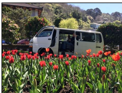
Enjoying a lovely van trip to see the tulips

Please remember that all new items need to be clearly marked with the owner's name before they arrive. This is especially important at Christmas time, when many lovingly chosen new items are given as gifts by family members. We discourage expensive woollen items, which are easily damaged in the wash. Please select easy care clothing wherever possible.