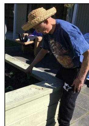
Residents and staff enjoy assisting our gardener to plant and maintain our raised vegetable beds

that closely mirrors a household living experience, with access to familiar homely pursuits such as showering, choosing what to wear, applying makeup and selecting jewellery, shaving, setting the table, folding linen, peeling vegetables, flower arranging, gardening, preparing and eating a meal, washing the dishes, or reading a magazine. In our small homes these interactions occur spontaneously with all staff and all residents every day, many times within a day.