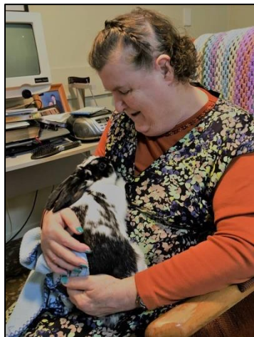
We enjoyed having a visit from Mellow, a beautiful bunny from the SPCA

As we move into the summer months some families express concern regarding the comfort and welfare of our residents on very hot days.