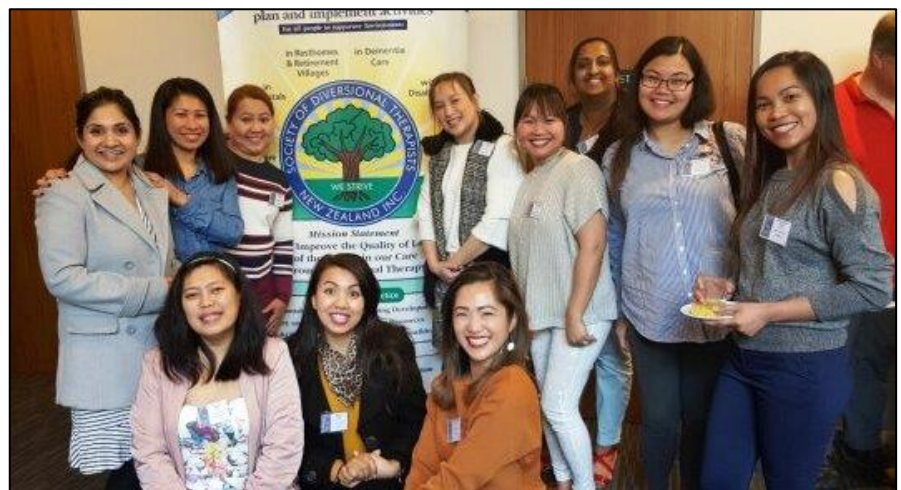
Dementia Care NZ had a great contingent at the Annual Diversional Therapy Conference in Christchurch