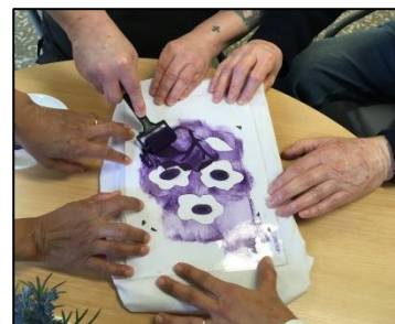
Making purple art as part of World Alzheimer's Day

I wish each and every one of you a very happy Christmas.