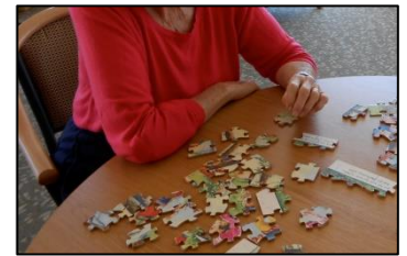
Enjoying the challenge of completing a puzzle