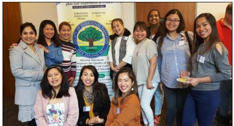
Dementia Care NZ had a great contingent at the Annual Diversional Therapy Conference in Christchurch