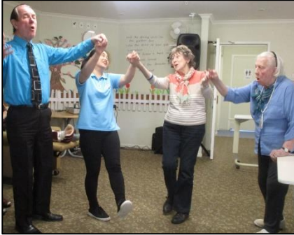
Having a fun time singing and dancing together

Please remember that all new items need to be clearly marked with the owner's name before they arrive. This is especially important at Christmas time, when many lovingly chosen new items are given as gifts by family members. We discourage expensive woollen items, which are easily damaged in the wash. Please select easy care clothing wherever possible.