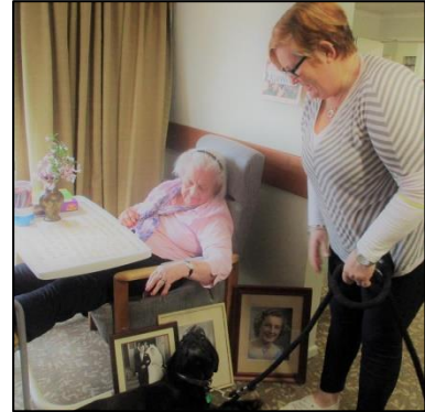
A rainy day looking at beautiful old photos and working on a jigsaw was made perfect by a visit from Fern, our much-loved therapy dog

I wish each and every one of you a very happy Christmas.