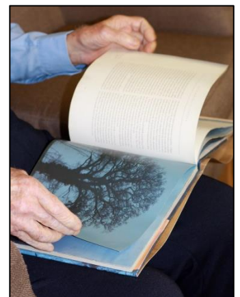
Settling down to enjoy a good book

that closely mirrors a household living experience, with access to familiar homely pursuits such as showering, choosing what to wear, applying makeup and selecting jewellery, shaving, setting the table, folding linen, peeling vegetables, flower arranging, gardening, preparing and eating a meal, washing the dishes, or reading a magazine. In our small homes these interactions occur spontaneously with all staff and all residents every day, many times within a day.