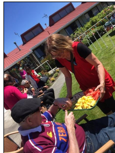
Residents enjoyed attending a special 'Show Dad' at Avonlea Dementia Care, Addington

We always welcome your ideas and concerns, and your loved one will never be disadvantaged by anything you may share with us.