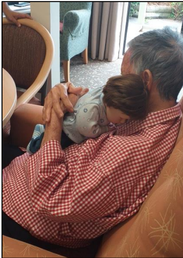
A person with dementia interacting with their new representational child is intensely moving

If you have any questions or concerns relating to Representational Child Therapy, or feel your loved one might benefit from this, please speak to our Diversional Therapy or Registered Nurse team.