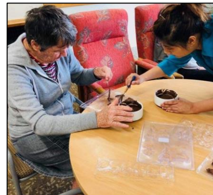
A happy afternoon making homemade chocolates together

I speak directly to each and every one of you: You are valued. You are loved. You are supported.