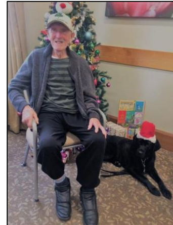
Residents enjoyed posing in from on the Christmas tree with our therapy dog Merlin

This is good news for our residents who, because of their age and dementia diagnosis, are at a higher risk of falling. For this reason families are usually asked whether they would like to purchase Hip Saver hip protectors for their loved one. We encourage you to consider the benefits of providing hip protectors for your loved one as a means to reduce their risk of serious injury.