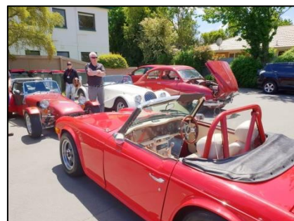
Residents at Avonlea had a very special treat recently with a visit from the Classic Motor Club with their spectacular classic cars

I speak directly to each and every one of you: You are valued. You are loved. You are supported.