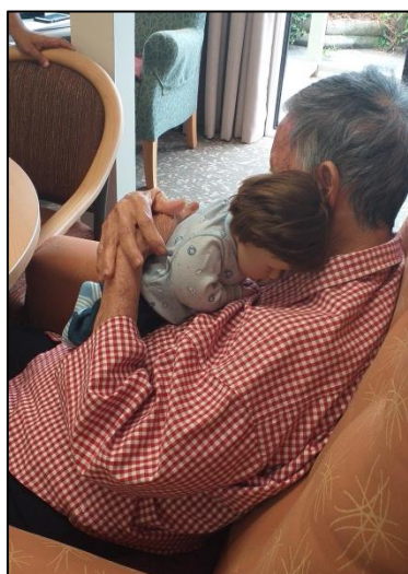
A person with dementia interacting with their new representational child is intensely moving

At times you may see residents with dolls or soft toys. The use of these 'representational children' is a recognised form of therapy for certain carefully selected residents.