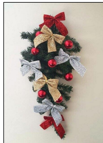
Christmas decoration craft-making brings us all pleasure and a sense of achievement

We always welcome your ideas and concerns, and your loved one will never be disadvantaged by anything you may share with us.