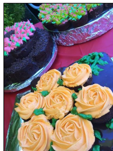
All our staff, including our cooks, went the extra mile to make our recent Show Day a wonderful experience for our residents

Please choose to vaccinate this winter, and help your loved one stay well!