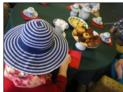
A little thought and care makes an ordinary event into a special occasion

This is good news for our residents who, because of their age and dementia diagnosis, are at a higher risk of falling. For this reason families are usually asked whether they would like to purchase Hip Saver hip protectors for their loved one. We encourage you to consider the benefits of providing hip protectors for your loved one as a means to reduce their risk of serious injury.