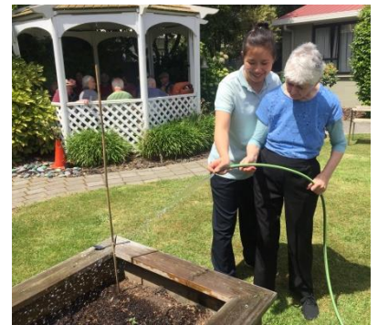
Relaxing in the gazebo and watering the garden and favourite summer pastimes

We always welcome your ideas and concerns, and your loved one will never be disadvantaged by anything you may share with us.