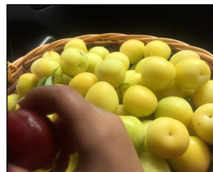
The fresh plums we picked for our home made jam were a feast for the senses!