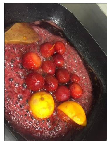
Making some plum and orange jam, which was enjoyed on fresh pikelets