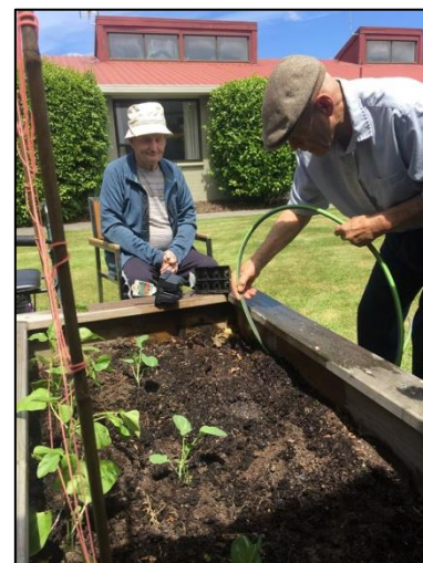
We share the responsibility of caring for our vegetable patch amongst a keen team

Thank you for letting us know that you appreciate them too.