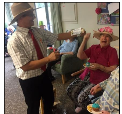
We had a fun afternoon with games, fancy hats and delicious food to celebrate Show Day