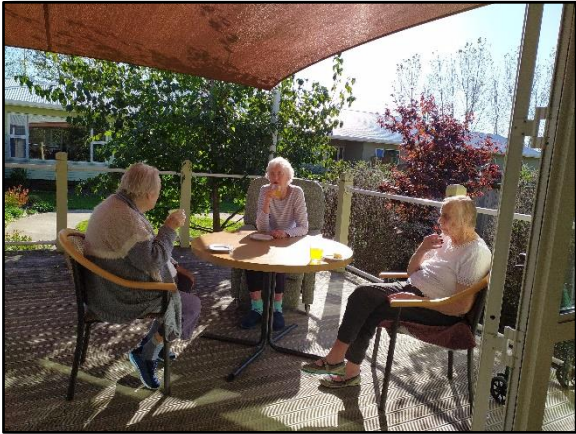
Enjoying lunch together out on the deck of Toetoe home

Every day, we go through our routines and do our best to take care of ourselves and the people around us. Perhaps this is the best way we can embody the Christmas spirit, by being mindful of others, by doing our part in keeping our surroundings safe, and by being kind and considerate to the people around us and offering help when we can. We live each day with hope and being open to the joy around us. As this year draws to a close, let us welcome the new year with hope for the future while living mindfully in the present.