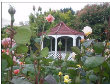
Christmas roses in bloom, Avonlea gardens, Christchurch

It's a magical time of the year, and we are blessed to have the opportunity to spend this time with the wonderful people in our care.