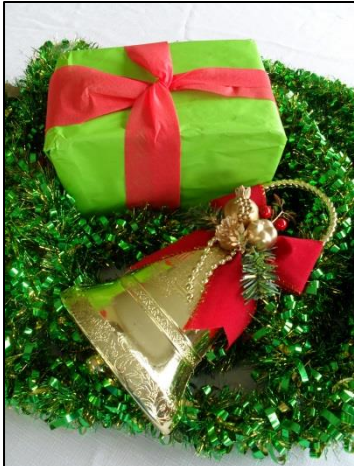
Christmas is traditional, simple and homely

Every year many of our staff leave their own families at home to help care for their other 'family' here. It is a time of closeness, laughter, special moments and much love.