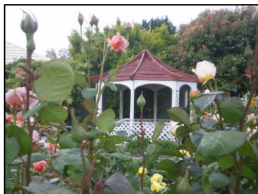
Christmas roses in bloom in our gardens

It's a magical time of the year, and we are blessed to have the opportunity to spend this time with the wonderful people in our care.