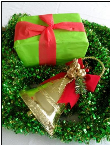
Christmas is traditional, simple and homely

Every year many of our staff leave their own families at home to help care for their other 'family' here. It is a time of closeness, laughter, special moments and much love.