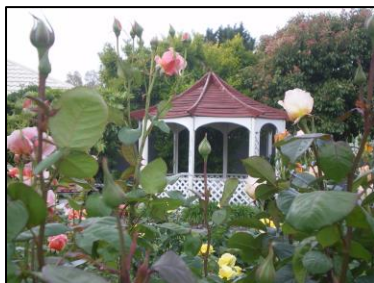
Christmas roses in bloom, Avonlea gardens, Christchurch

Christmas is always a special time in our rest homes. It's a time celebrated by our residents, families and staff together. It's an opportunity to have some lovely special events in the build up to Christmas. We all look forward to our Christmas family gathering. We have live entertainment. Our wonderful cooks excel themselves with home baked Christmas cake and mince pies and a delicious Christmas dinner.