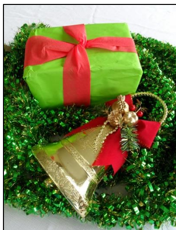
Christmas is traditional, simple and homely

Every year many of our staff leave their own families at home to help care for their other 'family' here. It is a time of closeness, laughter, special moments and much love.