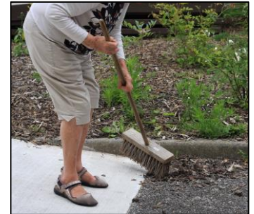
Familiar homely activities provide exercise and enjoyment

We always welcome your ideas and concerns, and your loved one will never be disadvantaged by anything you may share with us.