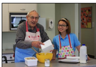
Enjoying the homely activity of cooking