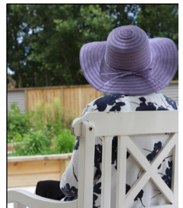
Rest and reflection in beautiful surroundings

We are on Facebook! Visit our website at www.dementiacarenz.co.nz to link to our Facebook page. 'Like' us and receive regular updates on our activities, news and views and links of interest!