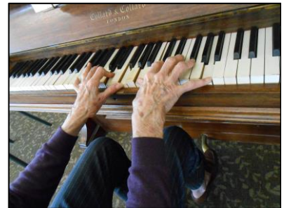
Piano playing is an activity which brings joy to us all

The small miracles our diversional therapy staff achieve are hard to come by, and the process is demanding, emotionally draining, exhausting, exciting, uplifting ... and, to the rest of us, at times almost invisible.