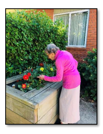
Our lovely garden brings us so much joy