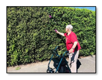
A neighbourhood stroll in the sunshine