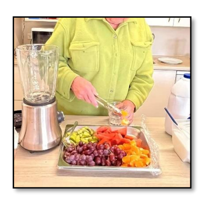
Making fruit smoothies together