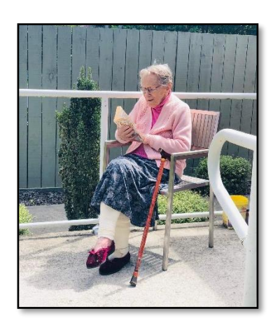
Happiness is the sun on your back and a good book