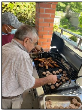
The pleasures of delicious food and great companionship

We believe this will make things easier and more convenient for you, and save time when visiting.