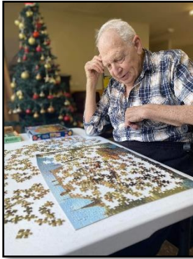
Engrossed in a jigsaw puzzle