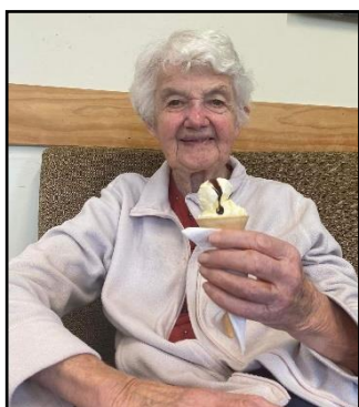
So many little pleasures in our daily lives here at our home

Summer is one of my favourite times of year with long evenings making it possible to catch up with people close to us, complete a few long-forgotten projects or just relax. I hope you have all enjoyed the holiday season and found some time to relax and recharge.