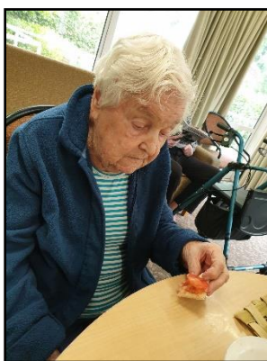
Fresh tomatoes from our garden on brown bread – the taste of home!

Since we moved into the newly-created Regional Clinical Manager roles in mid-2022 we have embraced many opportunities for growth, sharing and collaboration. Every day is day of learning, finding answers and solutions, updating information, advocating for others, and making sure everything is working well. There is sharing, energy, and much joy.