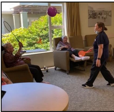
Balloon badminton is a firm favourite with us all