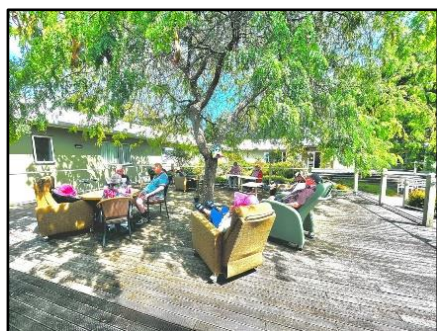
Our sheltered and spacious deck is the place to be in summer

We believe this will make things easier and more convenient for you, and save time when visiting.