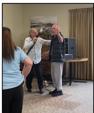
People are encouraged to participate in every aspect of life here at their home, and to remain connected with lifelong passions

Summer is one of my favourite times of year with long evenings making it possible to catch up with people close to us, complete a few long-forgotten projects or just relax. I hope you have all enjoyed the holiday season and found some time to relax and recharge.