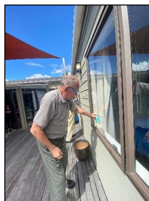
A spot of elbow grease to make those windows gleam