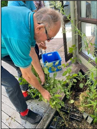
Autumn tidy-up in the garden