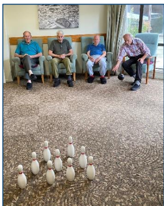
Anyone for skittles?