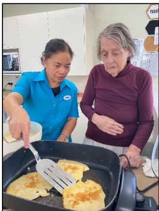
Making pancakes together in the kitchenette ...