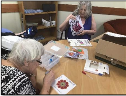
Close attention is required in this artwork project