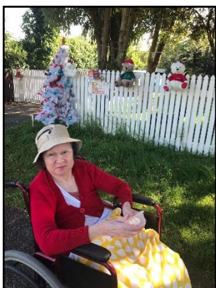
Wrapped up to stay cosy on an afternoon walk