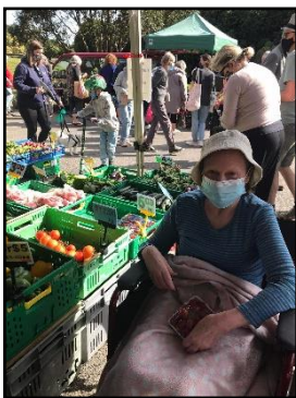
Out and about at a local market