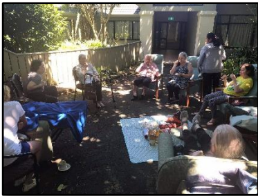
Time spent outside together enjoying the warmth of summer