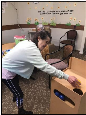
An indoor ball game provides fun and physical activity