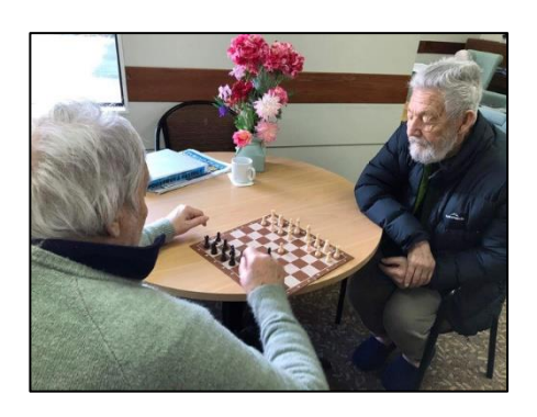
Pondering the next move