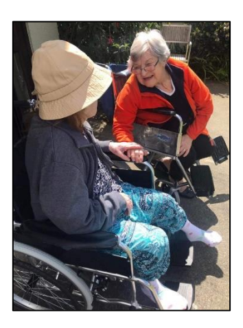
Sharing a joke together