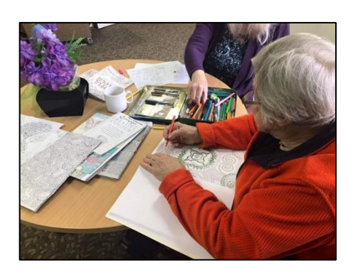
Sharing the enjoyment of a colouring project with friends