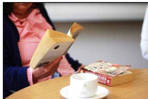
Simple pleasures: a good book and a hot cuppa