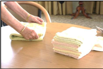
Helping out by folding freshly laundered towels