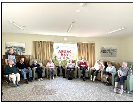
ANZAC day is honoured by our residents each year