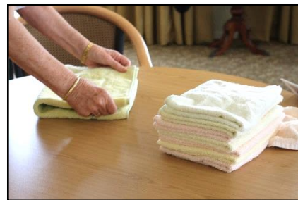
Helping out by folding freshly laundered towels