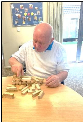
Jenga can be enjoyed alone or with a friend