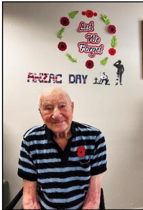
ANZAC day is honoured by our residents each year